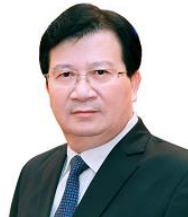
First Deputy Chairman: