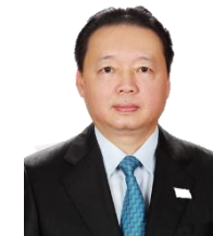
Second Deputy Chairman: