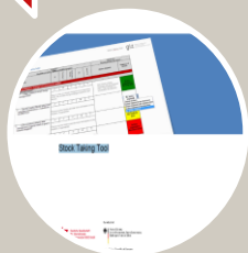
Stock Taking Tool (2017)

Sharing lessons learned and incorporate experiences