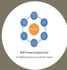
BUR Process Guidance Tool (2016)