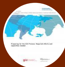
Preparing for the ICA process: Required efforts and capacities needed (2017)