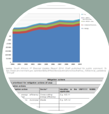
BUR Template (2017)