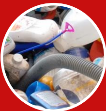
Good Practice Study on GHG-Inventories for the Waste Sector in Non-Annex I Countries (2015)