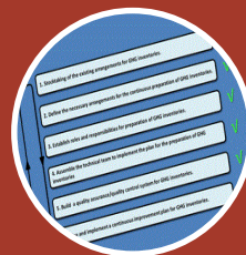
Guidance for setting up and enhancing national technical teams for GHG inventories in developing countries (2017)